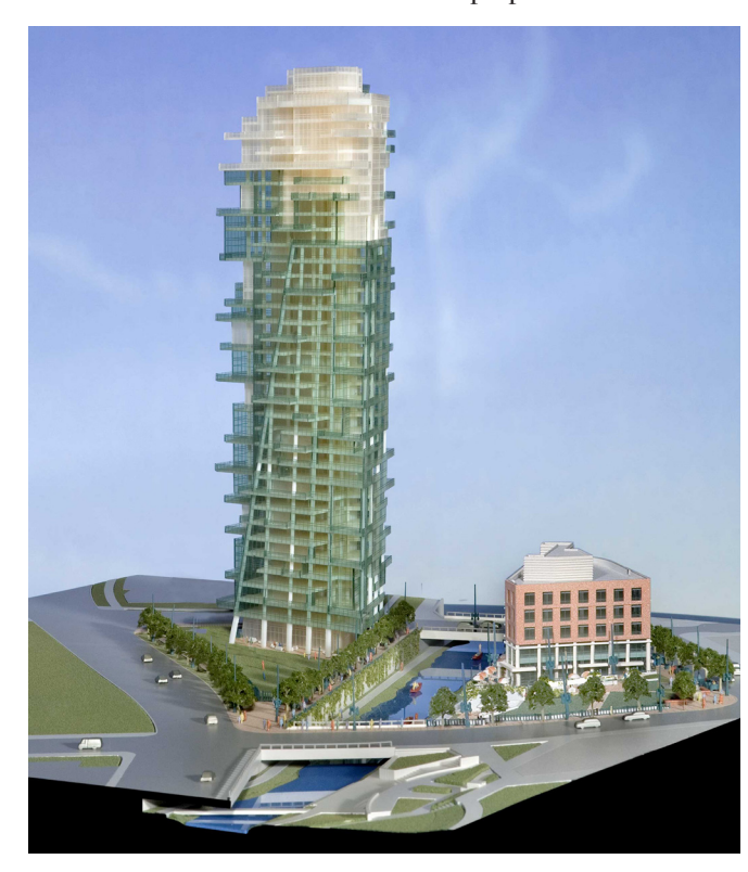
pictured above: Option 1, creating two projects of different styles. This preserves the view corridor. pictured below: Option 2, linked design with a lower scale.

Option 2 is to pursue a design under alternative two of the 2006 PUD, which would create roughly two, 5-8 story buildings. Economic assumptions regarding the value of the site as a marquee pricing option, and perhaps physical relationships to the established success of Larimer Square, would have to be embedded in such a proposal.